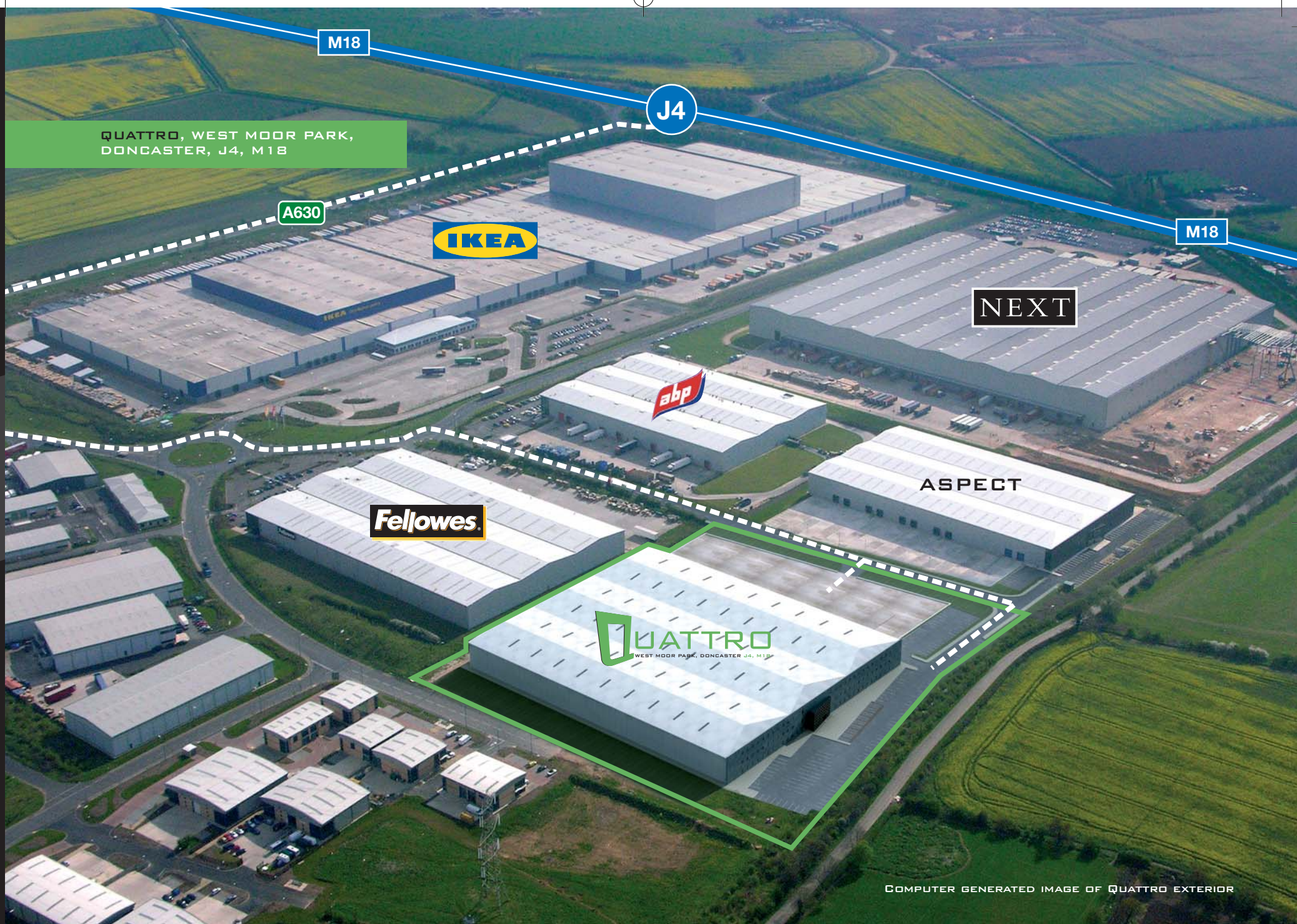
COMPUTER GENERATED IMAGE OF QUATTRO EXTERIOR

TO TAKE A VIRTUAL TOUR OF ASPECT, A PREVIOUS PHASE DEVELOPED IN 2005, PLEASE GO TO WWW.PROP360.COM/TOURS/100320