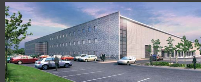
COMPUTER GENERATED IMAGE OF QUATTRO EXTERIOR