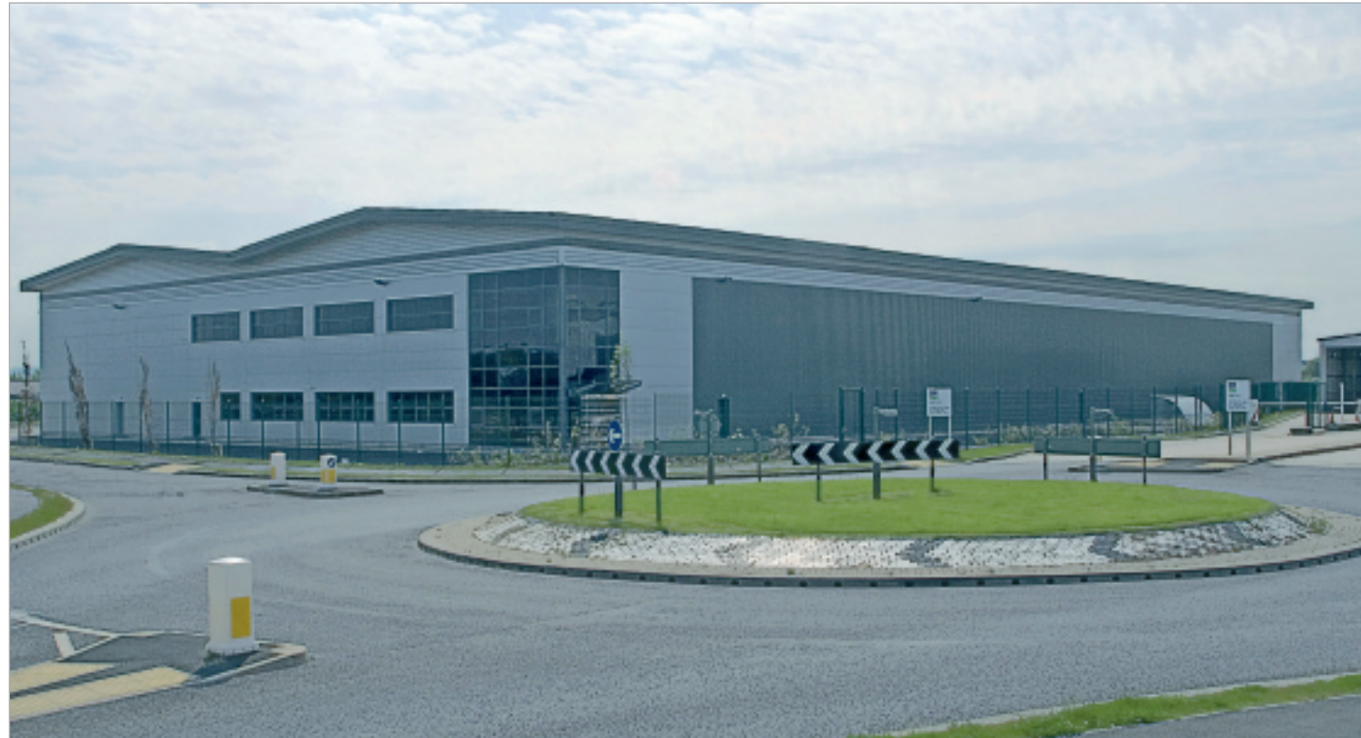
Image show previous phases at ISIS.

Planning consent granted for B1, B2 and B8 uses.