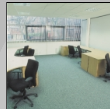
Typical Small Suite